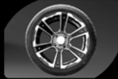
14"aluminum wheel with black insert and radial tire