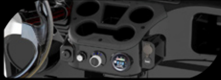
Black dashboard with four cup holders/cell phone holder