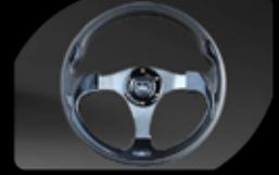
Luxury steering wheel