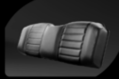
Two tone seat