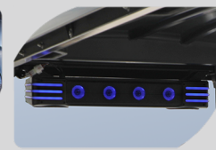
Cuboid Evolution Sound Bar