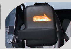
Powered Rear View Mirrors