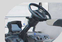
Adjustable Steering Column