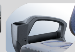
Rear Armrest With Built-in Storage Compartment