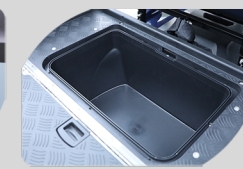
Rear Storage Compartment