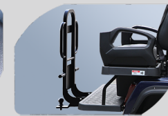
Rear Handrail with Optional Towing Hitch Receiver