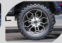
Silent Tire with Off-road Thread