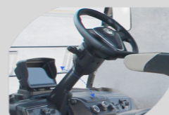
Adjustable Steering Column