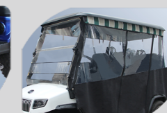
Optional All-Weather Enclosure