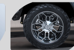
Silent Tire with Off-road Thread