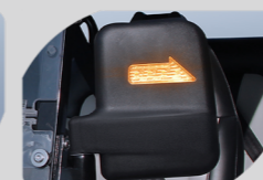
Powered Rear View Mirrors