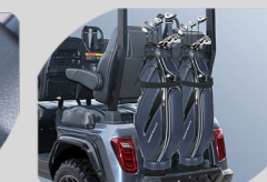
Optional Golf Bag Holder