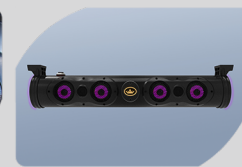
Cylindrical Evolution Sound Bar