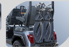
Optional Golf Bag Holder