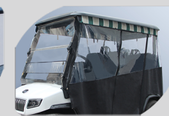
Optional All-Weather Enclosure