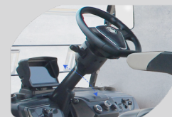
Adjustable Steering Column