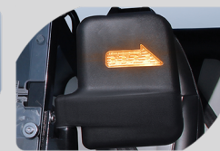
Powered Rear View Mirrors